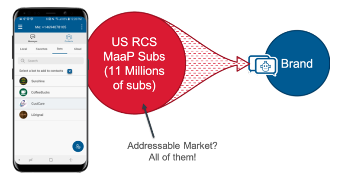
Total reach with RCS P2A (US 3Q18 example)

RCS clients include a dedicated interface (usually a tab) to search for chatbots or brands using names or categories (e.g. taxi, food, dance lessons, etc.), making the RCS P2A experience superior to SMS P2A experience from the brand discovery point of view. With SMS based P2A messaging, it is not possible to find a brand. Consumers need to know the short code (or the long code) of the brand to be able to initiate a conversation. With RCS, the users just need to start a search from the messaging application tab to find relevant brands in their location that can match their needs.